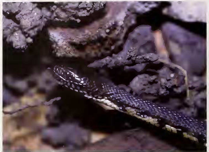
Fig. 15. Afronatrix anoscopus , juvenile, from Lokoli Forest, first country record.

Material examined. ZFMK 77014, Za-Kpota, coll. by native hunter, may 2002.